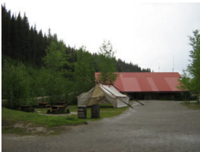
From rain to heat to smoke!

The next major event was the Autumn Moon Festival, which was also quite successful, although marred by a great deal of smoke in the air. The fire risk also caused the fireworks to be cancelled. We have had every kind of weather condition this summer – which is usual – now it seems fall is here.