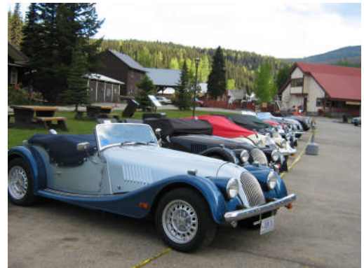
Morgan's parked at Barkerville

On August 6 th , it was St. Saviours Institute Night, where the employees and street theatre people perform in the Church, with many laughs and some funds raised for the Church, as well as refreshments afterwards. On August 15 th the Masons had their annual Church Parade